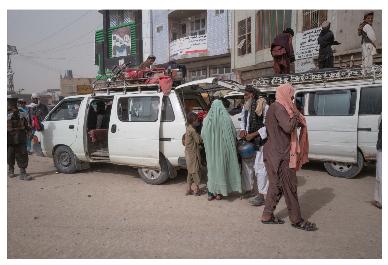
Marketplace, Kandahar, June 2022

A Case Study on Generating Employment through Small and Medium Business Development