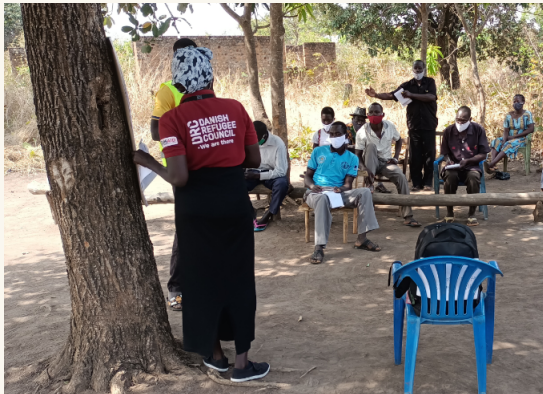
In the Picture Above: Illuminating the Path of Progress in an Ongoing Community Leaders Training at Nagero County in Upper Nile.

To ensure the successful implementation of high-quality CCCM Programs, DRC provides comprehensive training and support to community leaders and constructs dedicated community centers.