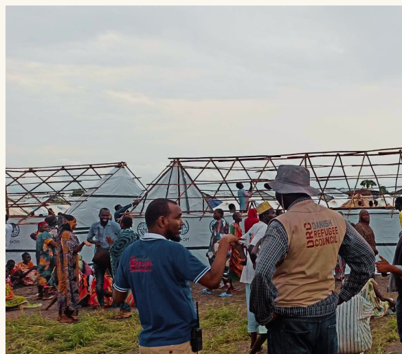
DRC is committed to Enhancing Living Conditions for Internally Displaced Individuals within PoC Sites through site improvement initiatives, ensuring a safer and more dignified living environment for internally displaced persons.

DRC regularly holds coordination meetings at various displacement sites, bringing together humanitarian actors and community leaders to foster efficient collaboration. These meetings aim to ensure that all parties involved work together effectively. In hard-to-reach areas that are remote and difficult to access, the Mobile Response Teams (MRT) take charge of organizing coordination meetings with other humanitarian actors. This helps facilitate the seamless provision of integrated assistance and allows for the exchange of valuable information derived from Camp Coordination and Camp Management assessments.