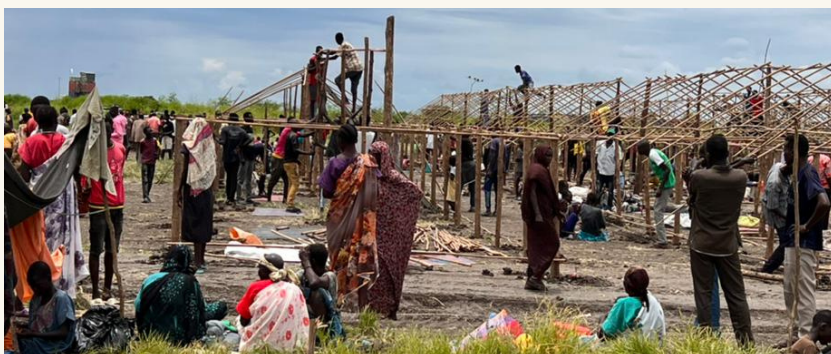
Embracing Hope: DRC CCCM team allocating Shelters to New Arrivals in Malakal Protection of Civilians (PoC) site. In the midst of uncertainty, this haven offers a lifeline to those seeking refuge, ensuring a place of respite and a chance to rebuild amidst the storms of displacement.

DRC implements a system wherein community leaders are appointed in every site or camp under its management, with the aim of fostering inclusivity across various segments of the community, including gender, age, persons with specific needs, and minority groups. Feedback, Complaint, and Response Mechanism (F-CRM) mechanisms are facilitated through dedicated F-CRM desks, complaint boxes, or outreach workers.