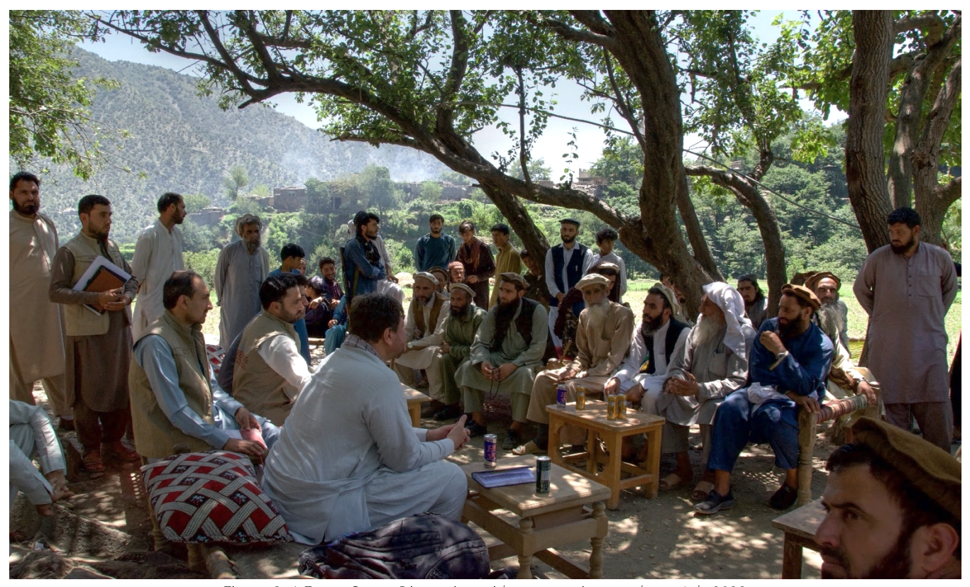
Figure 2: A Focus Group Discussion with community members, July 2023

With an estimated population of 1,085 residents, Monai village is situated in the North-West of Hesarak district (Nangahar province). Monai is the last village in Hesarak district, and it is connected with Khaki Jabbar and Surobi districts of Kabul province through the Kabul-Hesarak Road. Because of its location, this village has historically had strategic relevance, including during previous conflicts, leading to high levels of EO contamination. Today, due to its geographical remoteness and history of conflict, Monai village in Hesarak district is considered an hard-to-reach area.