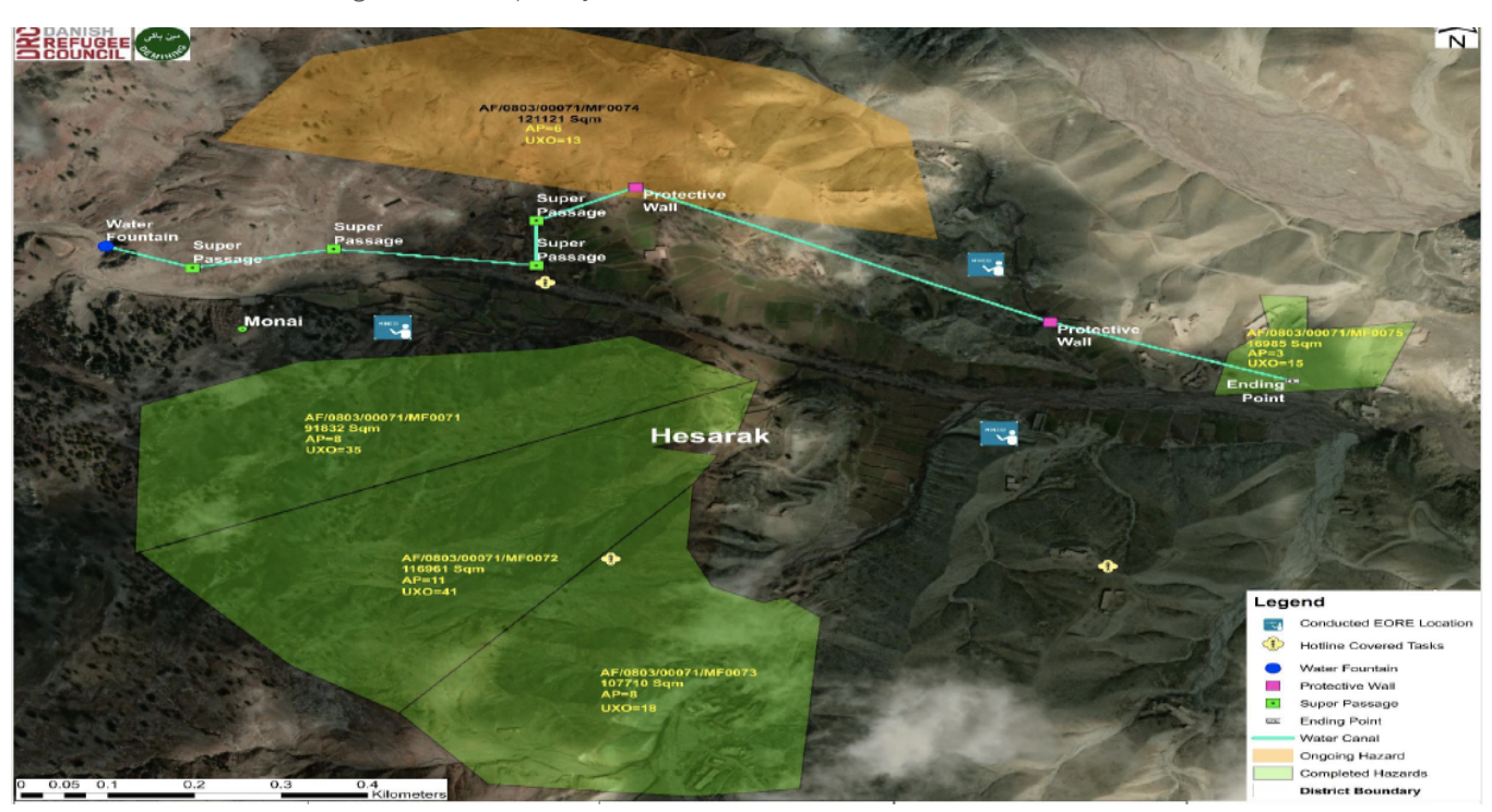
Figure 5: Activity Map, Monai Village, Hesarak District, September 2023

Assessment findings confirmed that the community's main priority was accessing water for irrigation and household use. As a result, DRC constructed a 300-meter-long intake canal to provide water for irrigation. The constructed canal, complemented by a series of protective walls and super passages, would not have been possible before the completion of the clearance operations, as part of the canal was built in previously EO-contaminated land. A total of 106 community members (90 unskilled and 16 skilled) were temporarily employed through a Cash for Work scheme to work on the construction of the canal to generate temporary income.