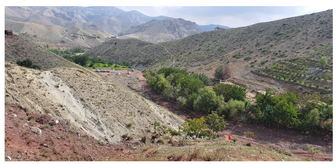
Figure 4: A picture of Monai village taken from one of the cleared hazards.

Alongside the removal of EO threats, the DRC mixed-gender EORE team conducted Explosive Ordnance Risk Education sessions to 1,719 individuals in Monai and surrounding villages to reduce casualties by promoting safe behaviour among at-risk groups.