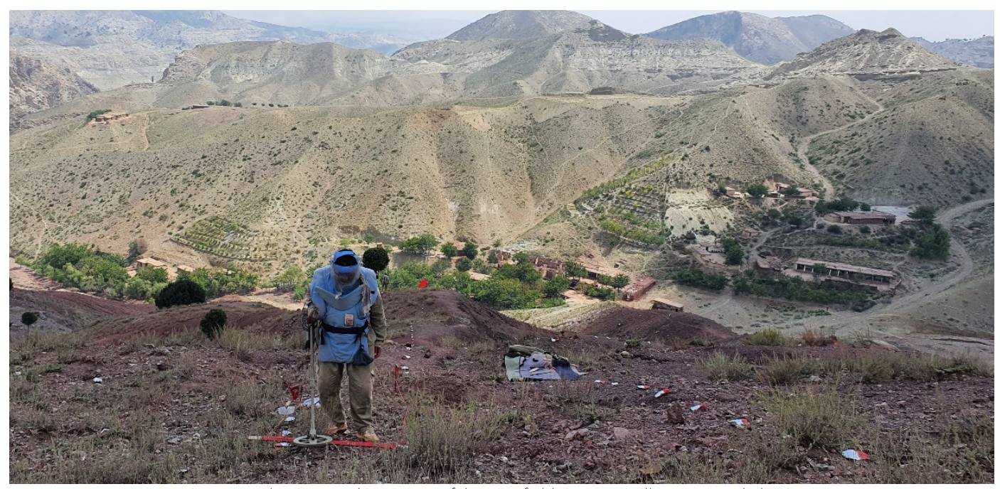
Figure 1: A deminer working in one of the minefields in Monai village, Hesarak district.