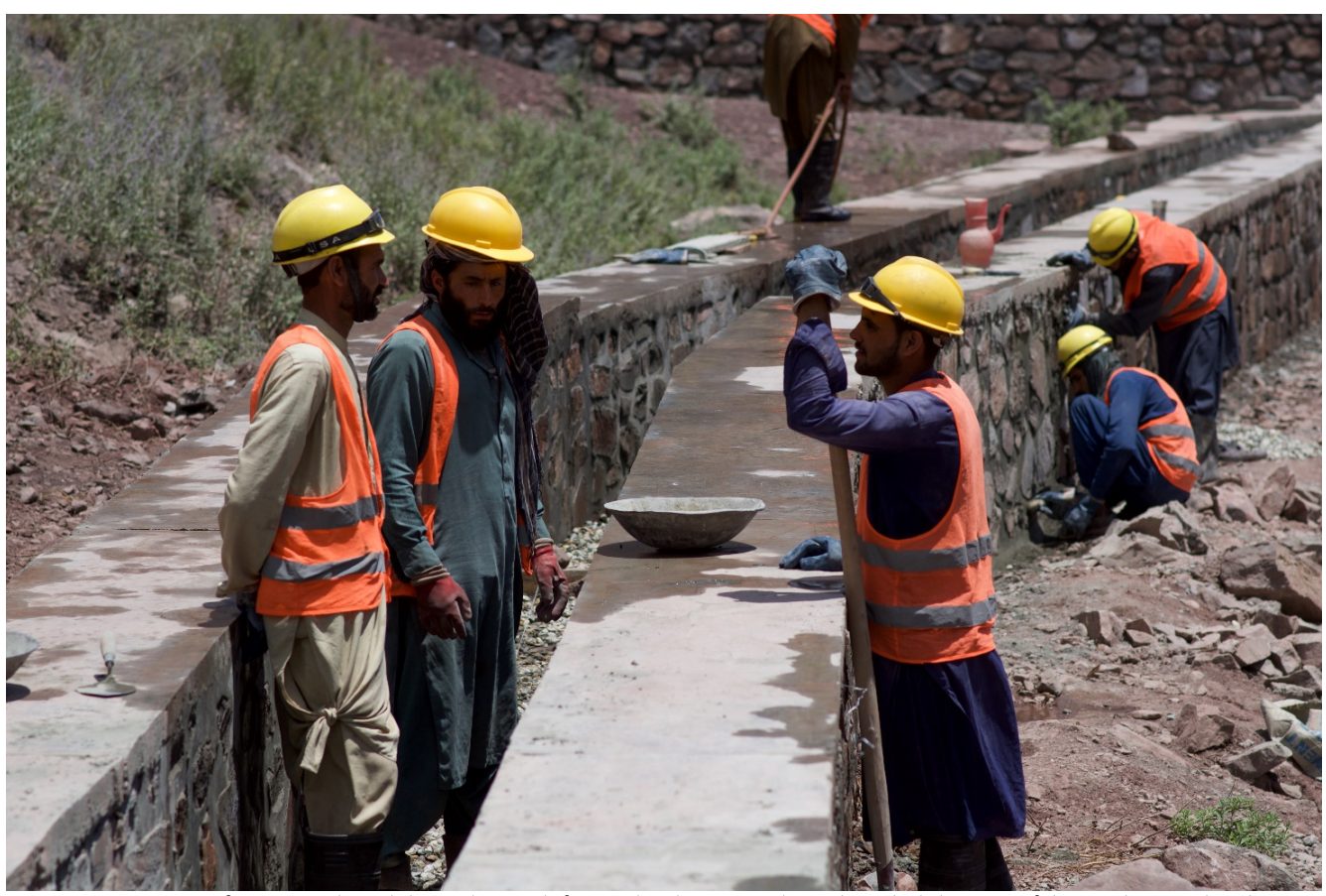
Figure 6: A group of men employed through a cash for work scheme work on the rehabilitation of the intake canal, July 2023

Finally, to reduce the negative impact of flash floods, DRC also built terraces using local materials and labour and planted fruit trees on cleared land (on the hill sides marked by three released tasks on the map above, lower left corner). As part of the Dutch MFA-funded project, DRC established 1,000 terraces for walnut plantation and has already identified a nursery to continue planting these trees in the future. Thanks to this project, the community will be able to generate a sustainable source of income in the upcoming 3-5 years. Applying the techniques shared by DRC teams, community members will be able to maintain and further expand the terraces and to promote the reforestation and resilience of the Monai community.