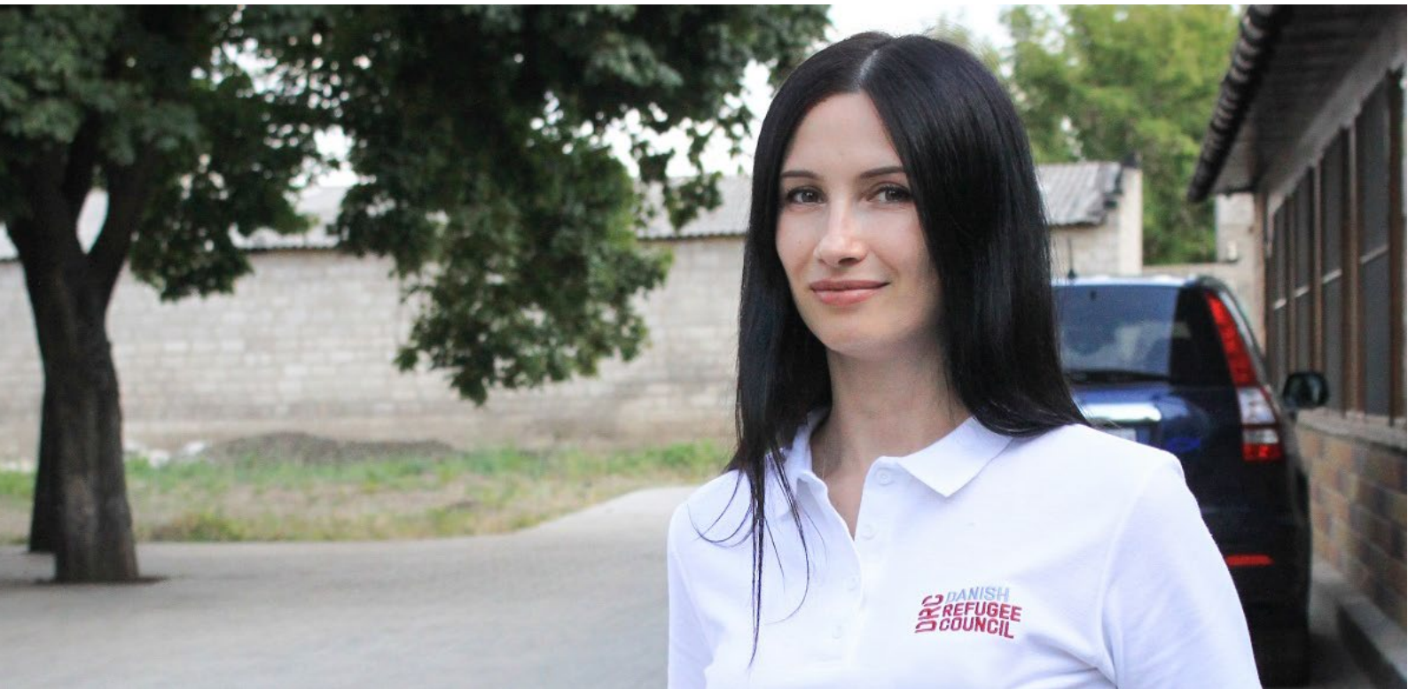
Kramatorsk, Donetsk Oblast, 2020

Joining the DRC Ukraine Team in Humanitarian Mine Action was a milestone in my career. When years ago, the territory of my home city in eastern Ukraine was contaminated with Explosive Ordnance, I realised that my skills may be helpful, perhaps not in clearance, but in the information support of mine action programmes. This work can literally save lives and I'm proud to be a part of it.